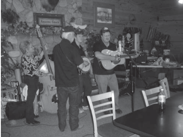
Backyard Bluegrass Acoustic Band