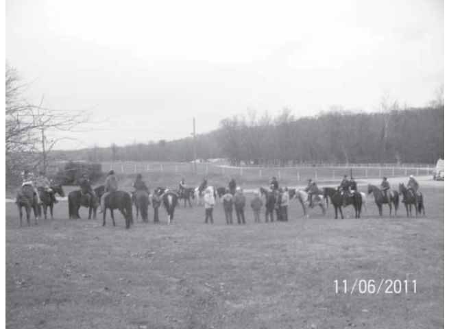
Cowboy Church on Sunday