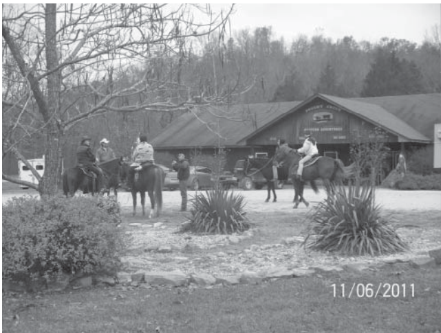
Gathering at the Brushy Creek Lodge