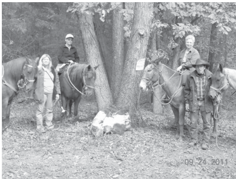
National Public Land Days Work Group

Members will be notified of the 2012 re-organization chapter meeting which will be scheduled in January or early February.